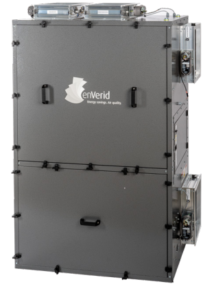
HLR 200M Module

The HLR 200M is enVerid's award-winning air cleaning product that removes CO 2 and contaminants of concern from indoor air so that it can be safely recirculated. This solution reduces first costs and operating costs for new and existing HVAC systems, lowers a building's carbon footprint, and improves indoor air quality while also generating LEED and WELL building credits. Indoor air quality is improved by removing indoor-generated contaminants and reducing the intake of outdoor pollutants. The HLR 200M solution is compliant under ASHRAE 62.1 and IMC 403.2. The HLR 200M module is designed for indoor use. The HLR 15R module (not shown) is an outdoor model designed for rooftop installations.