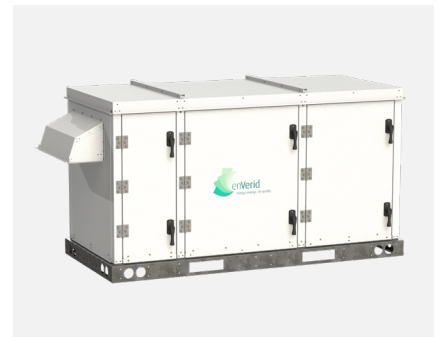
HLR 200R Module

The HLR 200R is enVerid's award-winning air cleaning product that removes CO 2 and contaminants of concern from indoor air so that it can be safely recirculated. This solution reduces first costs for new construction and lowers operating costs for all HVAC systems, lowers a building's carbon footprint, and improves indoor air quality while also generating LEED and WELL building credits. Indoor air quality is improved by removing indoor-generated contaminants and reducing the intake of outdoor pollutants. The HLR 200R solution is compliant under ASHRAE 62.1 and IMC 403.2. The HLR 200R module is designed for outdoor use, typically on a rooftop. The HLR 200M module (not shown) is a model designed for indoor installations.