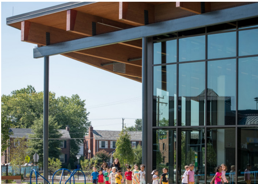
Figure 1: Alice West Fleet School