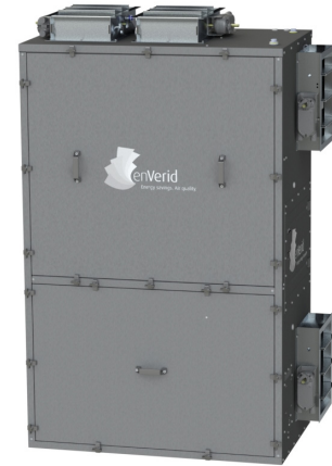
HLR 200M Module

The HLR 200M is enVerid's award-winning air cleaning product that removes CO 2 and contaminants of concern from indoor air so that it can be safely recirculated. This solution reduces first costs and operating costs for new and existing HVAC systems, lowers a building's carbon footprint, and improves indoor air quality while also generating LEED and WELL building credits. Indoor air quality is improved by removing indoor-generated contaminants and reducing the intake of outdoor pollutants. The HLR 200M solution is compliant under ASHRAE 62.1 and IMC 403.2. The HLR 200M module is designed for indoor use. The HLR 15R module (not shown) is an outdoor model designed for rooftop installations.